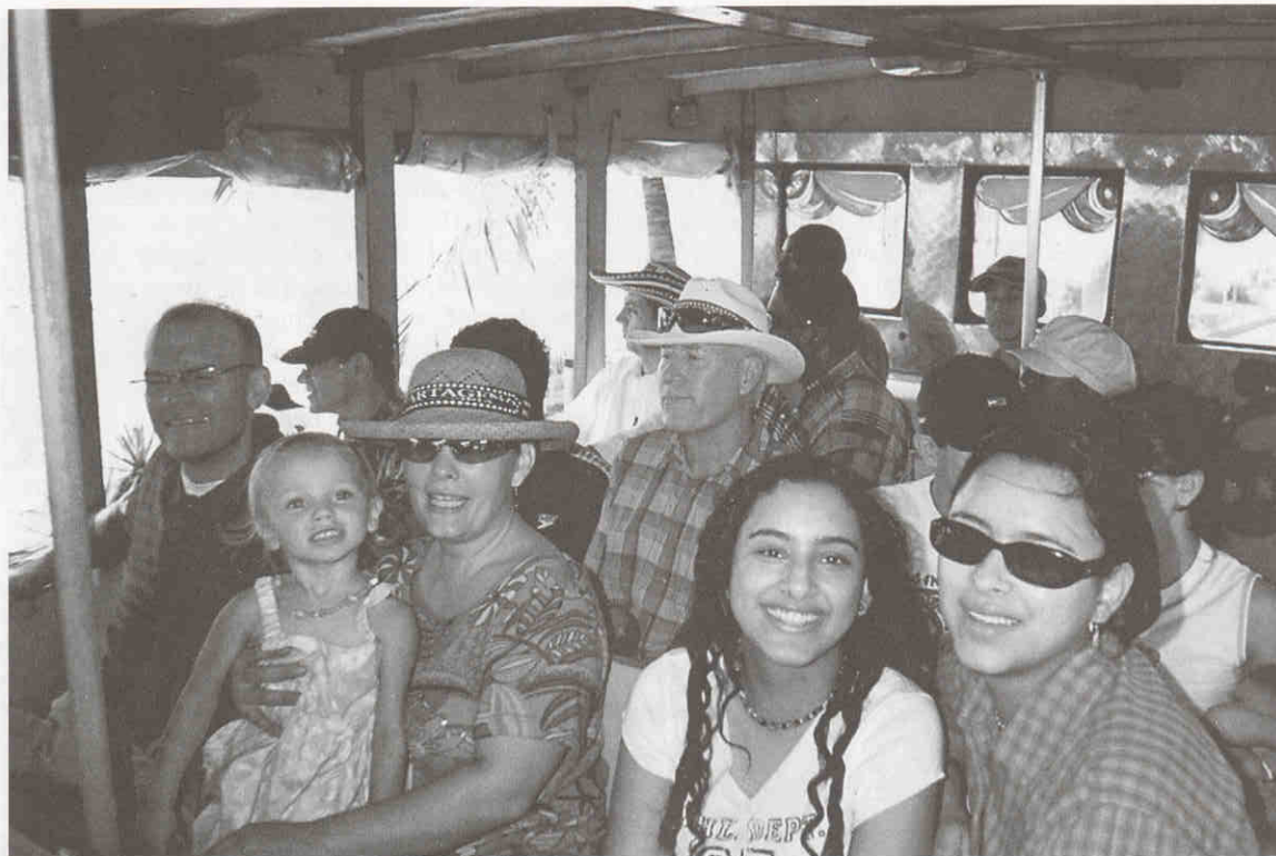
SIGHTS TO SEE Brethren in the Netherlands peruse the new Imperial Envoy (left). Colombian brethren (above) on a bus tour of Cartagena.